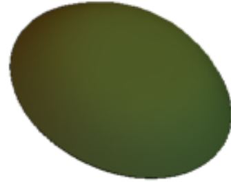
Figure 3: Ravioli Filling