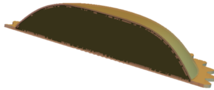
Figure 2: Ravioli Cross-Section